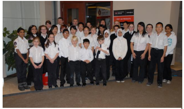
Our Youth – shining examples of our future leaders.

On behalf of the leadership team, I would like to congratulate the Youth members on their accomplishments this year and I would like to thank the Youth Leaders for their dedication and commitment to helping our youth develop life skills and a sense of community responsibility.