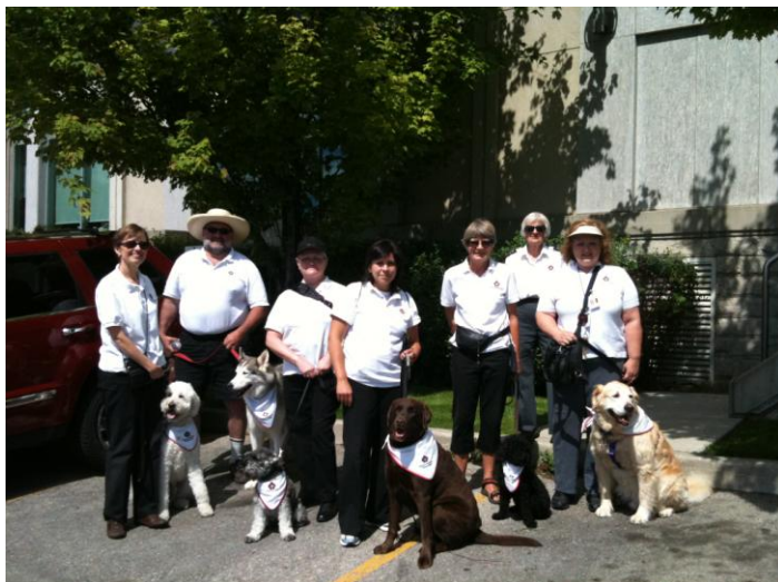
Some of our dedicated Therapy Dog team – Canada Day 2010

Congratulations to all the team members who made this award possible. You are an amazing group of student volunteers who have surpassed all expectations in training and commitment.